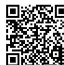
Emblems of Belonging

If there are Primary children advancing from Primary to Young Men or Young Women they may receive a certificate of advancement (see Handbook 12.1.3 for the link to certificate). Make a plan on who will prepare the certificates and how they will be presented.