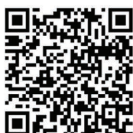
Primary General Handbook

Note: This is the over-arching Primary theme, which is different than the Come, Follow Me focus.