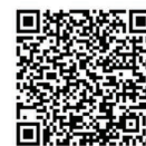
Temple and Priesthood Preparation